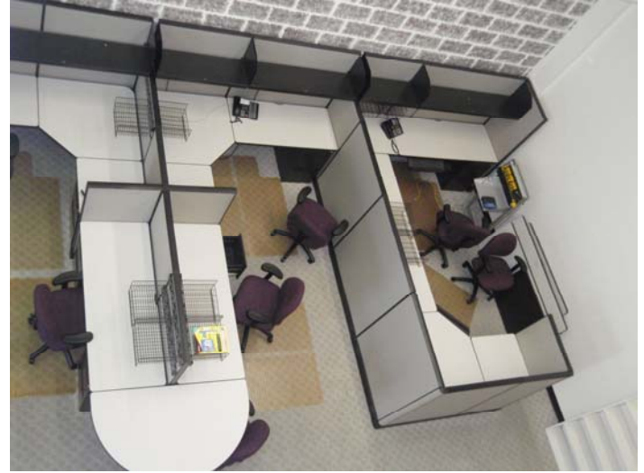
Front Office Area